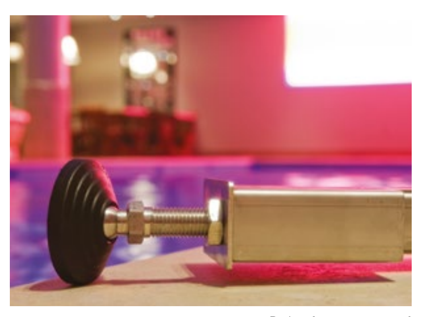
Designed to protect your pool