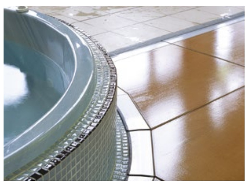
Can fit around specific pool features