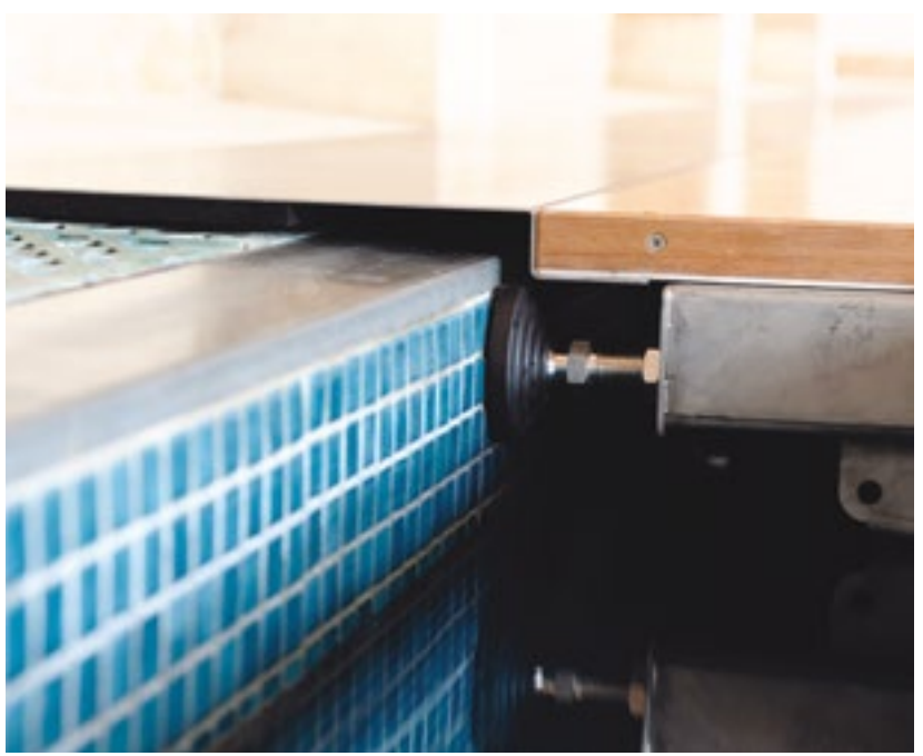
Premium build quality