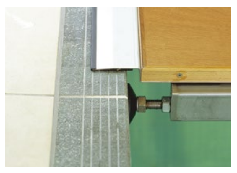
Flush fitting system

The oversail system will result in an edge finish that overlaps the edge of the pool, with a 24mm graduated lip in aluminium or teak.